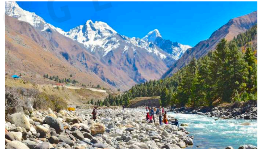
Sangla Vallley - Himachal

One can also go for an early morning 2 km walk up to the old Buddhist Monastery in Sangla. Overnight stay at the Sangla.