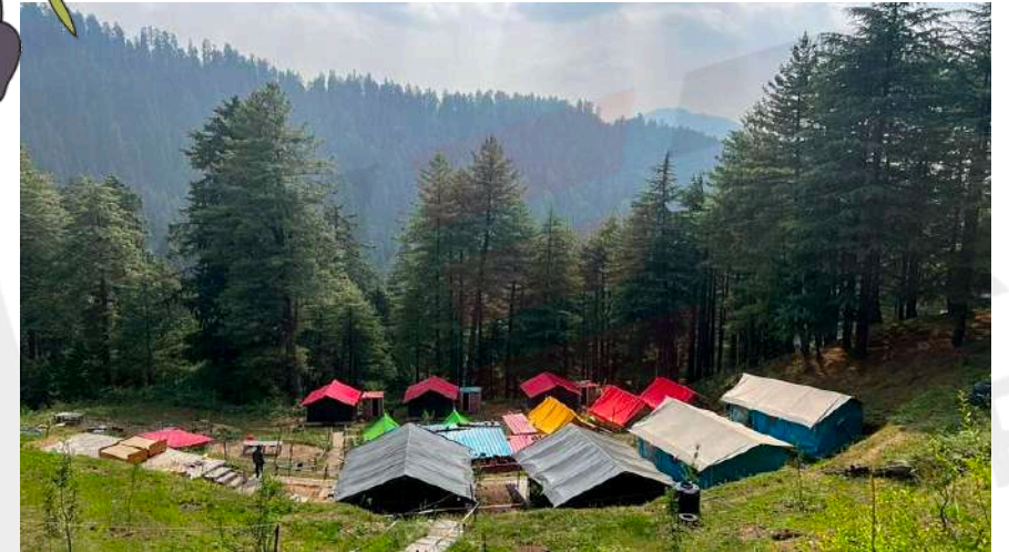
Vanvaas Camp - Narkanda

On arrival in Narkanda hotel .check-in hotel & over night stay in Camp.