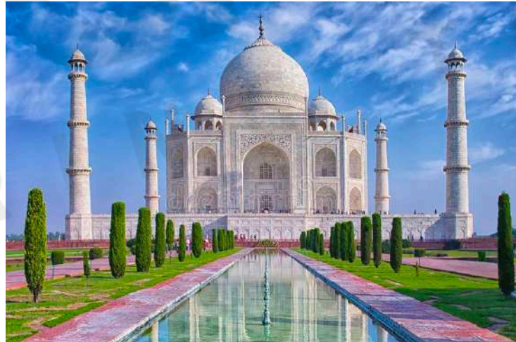
Taj Mahal- Agra