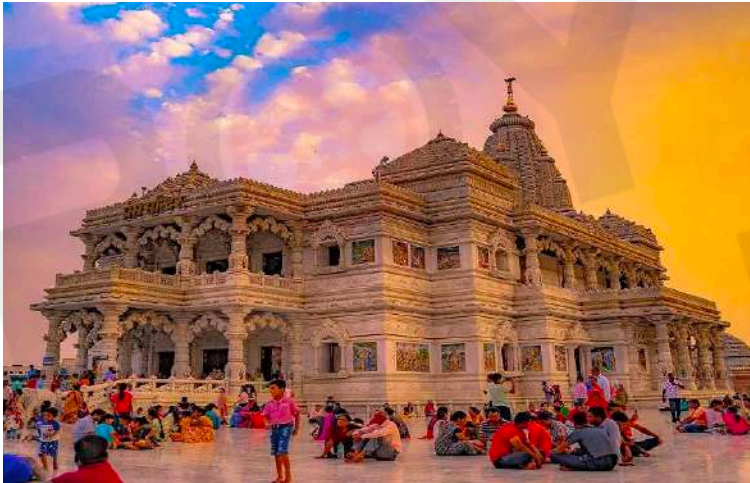
Prem Mandir- Vrindavan

After an early breakfast, check-out from hotel and proceed towards Nagpur. A long journey back home via Jhansi. Reach Nagpur and rest post check-in.