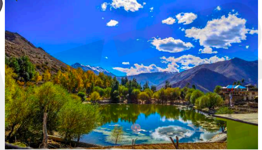
Beautiful Nako Village

The area is known for its lake, Nako Lake which forms part of the border of the village. Nako Monastery is located in the village as well as several other Buddhist temples.