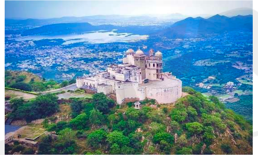
Sajjangadh Fort - Udaipur

Upon reaching the destination have dinner and rest.