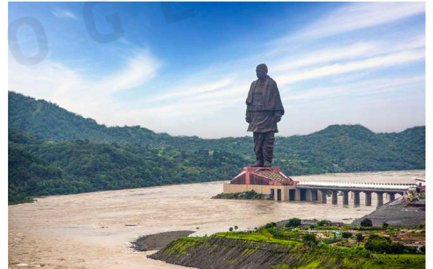
Statue Of Unity - Kevadia