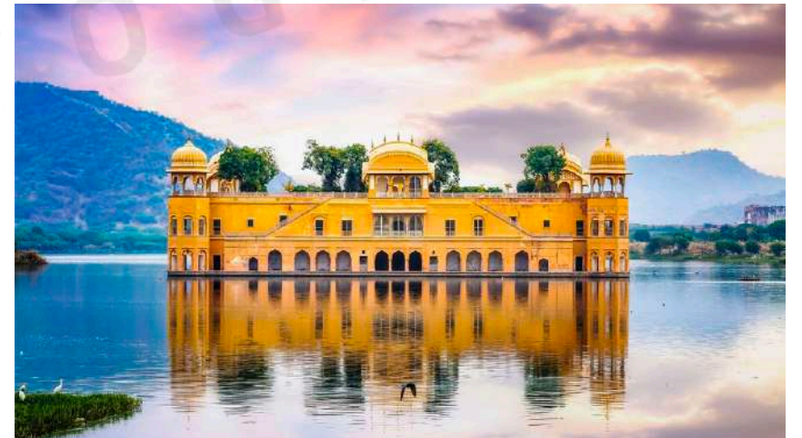
Jal Mahal - Jaipur