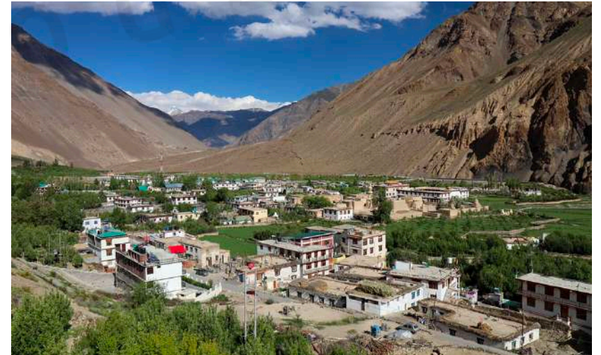
Tabo Village - Himachal

The town surrounds a Buddhist monastery called Tabo Monastery, according to legend, is said to be over a thousand years old. His Holiness the Dalai Lama has expressed his desire to retire to Tabo.