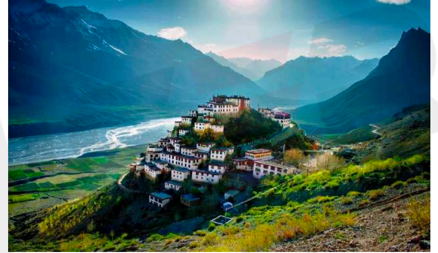
Kaza Village - Himachal