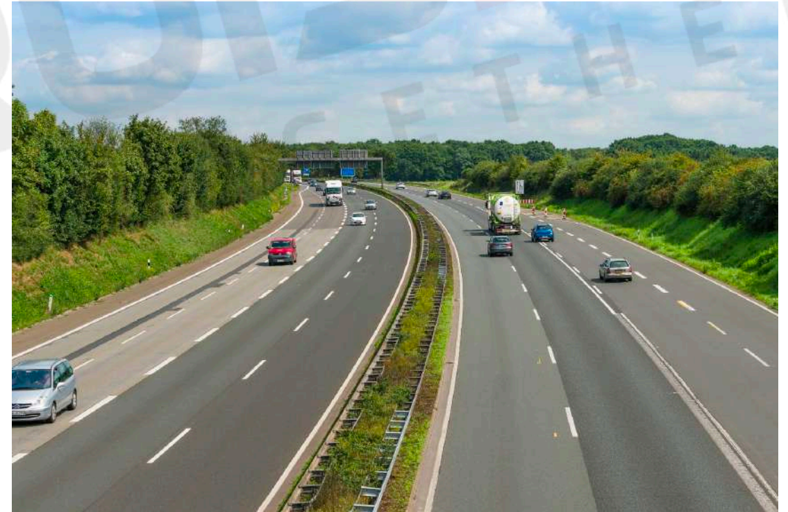
Hyderabad- Bengaluru Highway