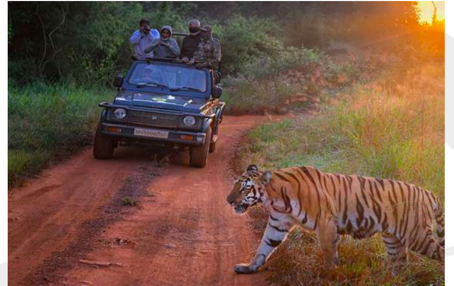
Tadoba Jungle Safari

Upon reaching the destination have dinner and rest.