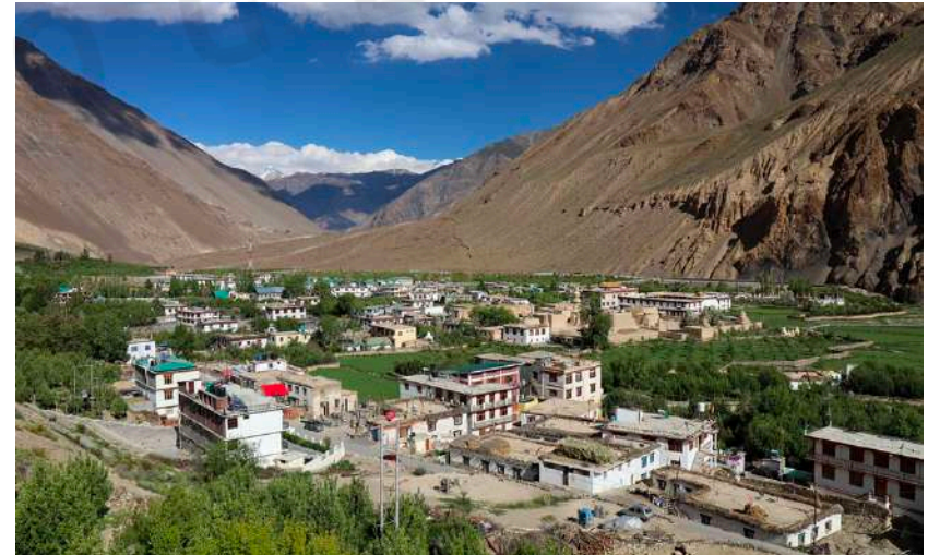
Tabo Village - Himachal