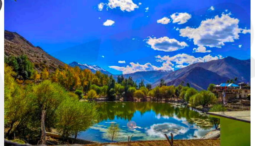
Beautiful Nako Village

The town surrounds a Buddhist monastery called Gue Monastery, according to legend, is said to be over a thousand years old. His Holiness the Dalai Lama has expressed his desire to retire to Tabo.