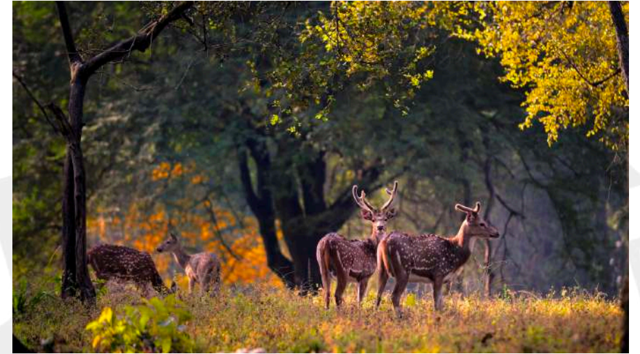
Kanha Tiger Reserve

Overnight stay in Bandhavgarh Jungle resort.