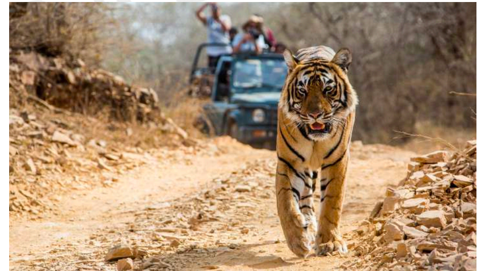
Jungle safari - Bandhavgarh