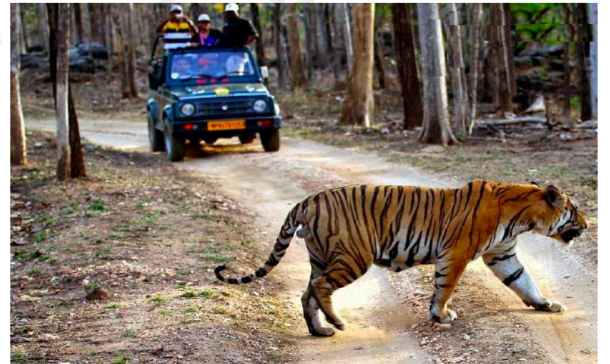
Pench Tiger Reserve