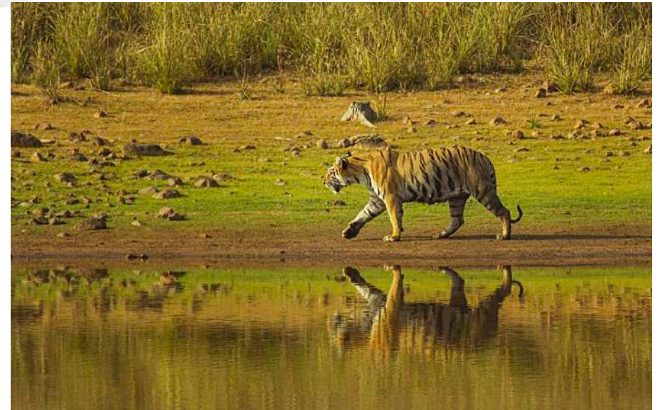
Tadoba Tiger Reserve