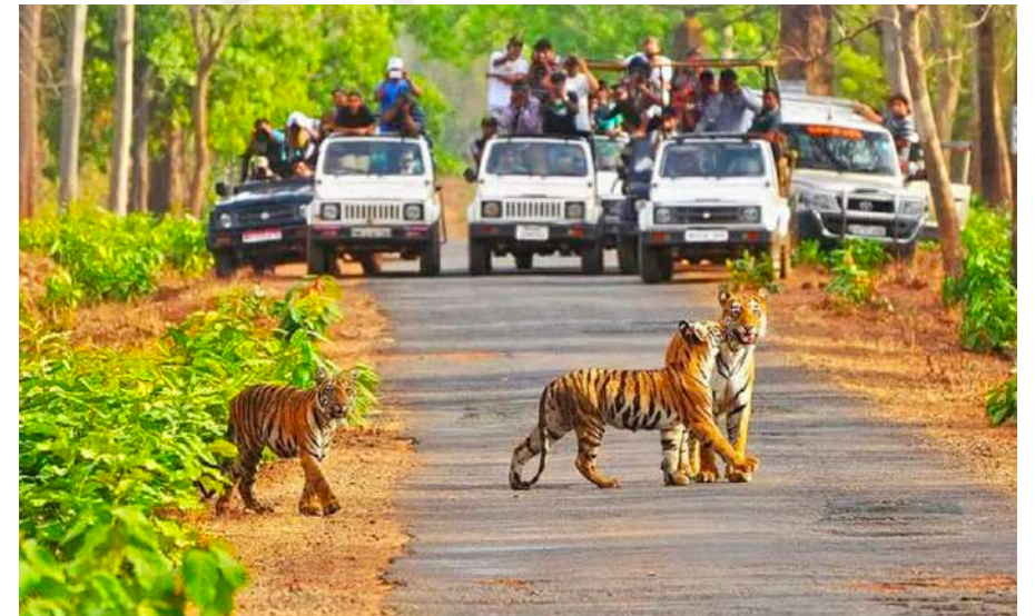
Jungle Safari - kanha