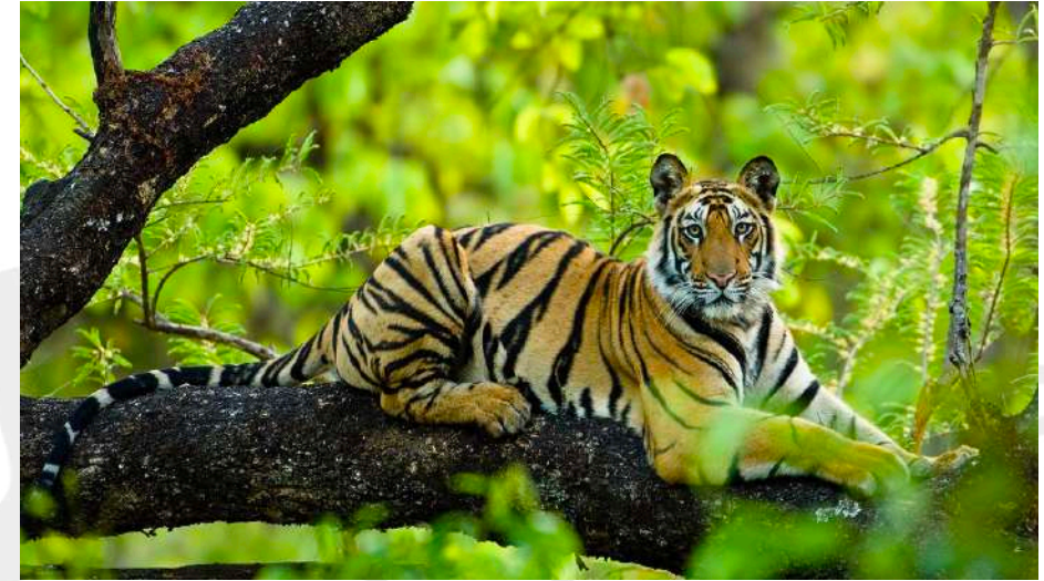
Bandhavgarh Tiger Reserve